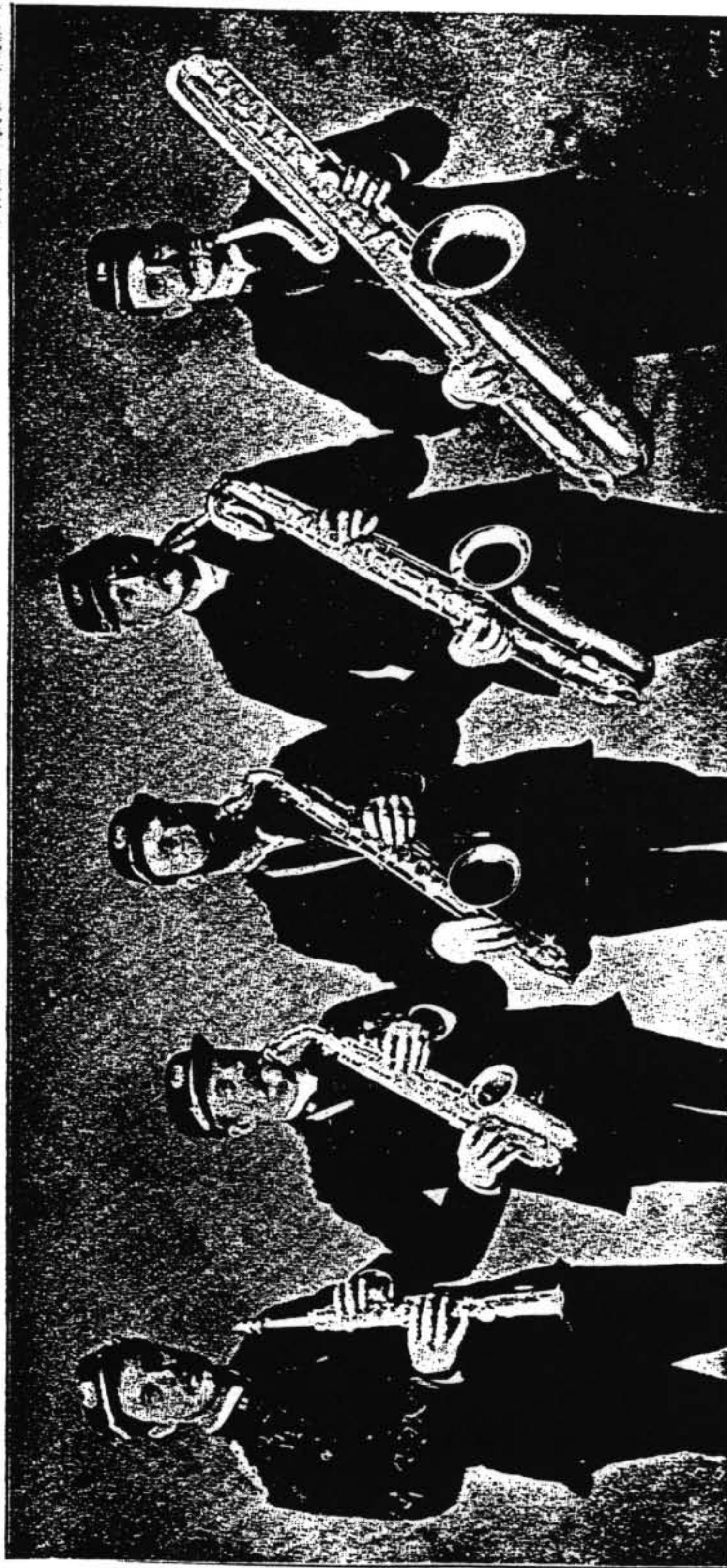
QUINTETT OF SAXOPHONES.